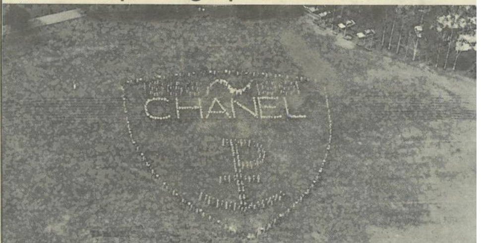
Chanel College students lined up for a group photograph on Wednesday morning...but not for your average school snapshot. In fact, the only ones to appreciate their efforts were high flying birds or passengers in aircraft flying over the school. The students and teachers posed for the photograph to celebrate the school's 25th jubilee. A colour photograph of the day will be published in the school magazine later this year.